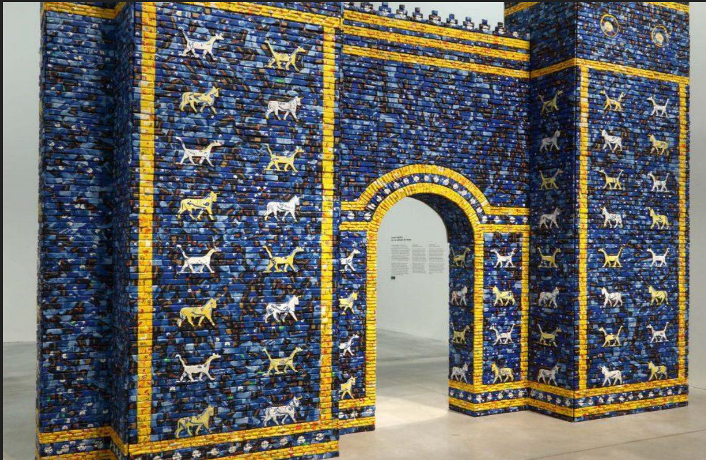
Michael Rakowitz, May the Arrogant Not Prevail 2010 Found Arabic packaging and newspapers, glue, cardboard, and wood; 235 ¼ x 194 ¼ x 37 ½ in. (597.5 x 493.4 x 95.3 cm).