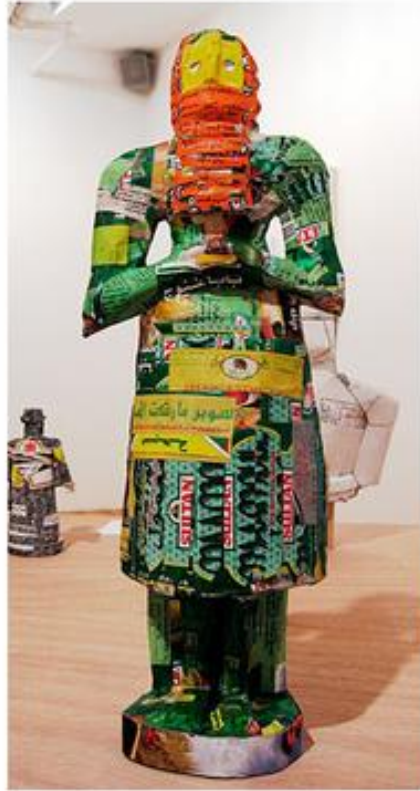
Michael Rakowitz, The Invisible Enemy Should Not Exist 2007-ongoing Middle Eastern packaging and newspapers and glue; roughly 15 \frac{7}{10} \times 4 \frac{7}{10} \times 1 \frac{3}{5} in. ( 40 \times 12 \times 4 cm).