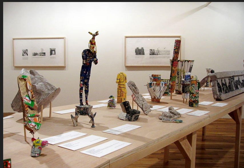
Michael Rakowitz, The Invisible Enemy Should Not Exist 2007-ongoing Middle Eastern packaging and newspapers and glue; roughly 15 \frac{7}{10} \times 4 \frac{7}{10} \times 1 \frac{3}{5} in. ( 40 \times 12 \times 4 cm).