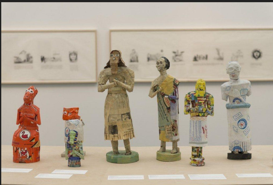
Michael Rakowitz, The Invisible Enemy Should Not Exist 2007-ongoing Middle Eastern packaging and newspapers and glue; roughly 15 \frac{7}{10} \times 4 \frac{7}{10} \times 1 \frac{3}{5} in. ( 40 \times 12 \times 4 cm).